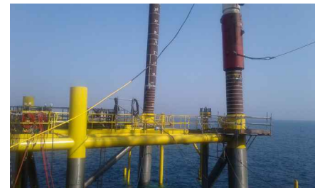
Marine application of pile monitoring services for tubular steel piles of a four-legged jacket.

Over the last 20 years Fugro has gathered pile monitoring data and CAPWAP analyses worldwide, with a strong offshore experience. Its geotechnical experts provide state-of-the-art consultancy services to help our Clients reduce the risk of pile installation and to improve significantly the geotechnical site characterisation of the area.