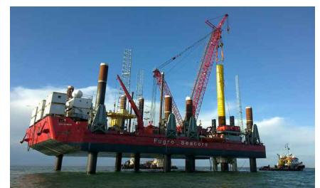
Marine application of pile monitoring services for large diameter monopiles.