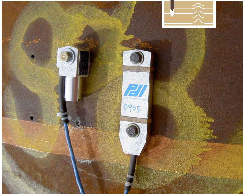
Strain and accelerometer sensors installed on a steel pipe pile (bolted type).

and many codes require this CAPWAP ® signal matching for the final capacity evaluation.